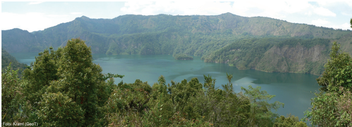
Fig. 1: Ngozi volcano caldera.

high elevation causing logistical difficulties in development of the resource) and two additional high-temperature systems (Mount Meru and Ol Doinyo Lengai) are assumed to reflect an immature status (Hochstein et al. 2000). Additionally, all possible high-temperature prospects in Northern Tanzania are situated in ecological sensitive areas (National Parks, Conservation Areas, UNESCO Heritage sites) and are of utmost importance for the tourism industry. Since no geothermal law is in place for utilization of geothermal resources in such sensitive areas, project development is not expected to take place in Northern Tanzania in the near future.