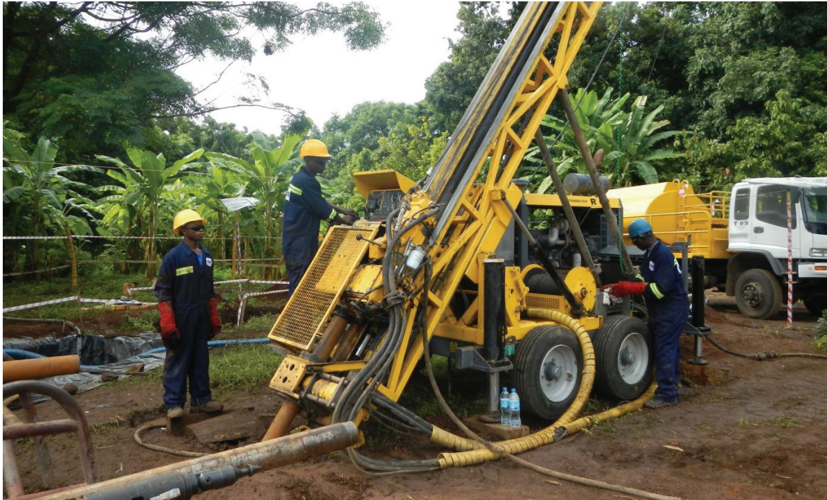
Fig. 3: Drilling of exploration well at Mbaka fault using the Atlas Copco CS-14 rig.